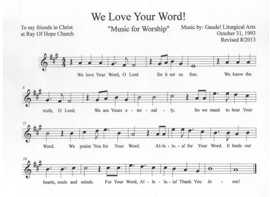
January 29, 2023 Memorial Service page: 16

©1993 by Gaude! Liturgical Arts. All Rights Reserved. International Copyright Secured. Reprinted here under CCLI#706121